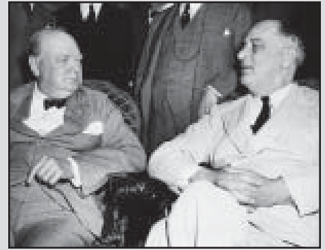
Sir Winston Churchill and Franklin D. Roosevelt