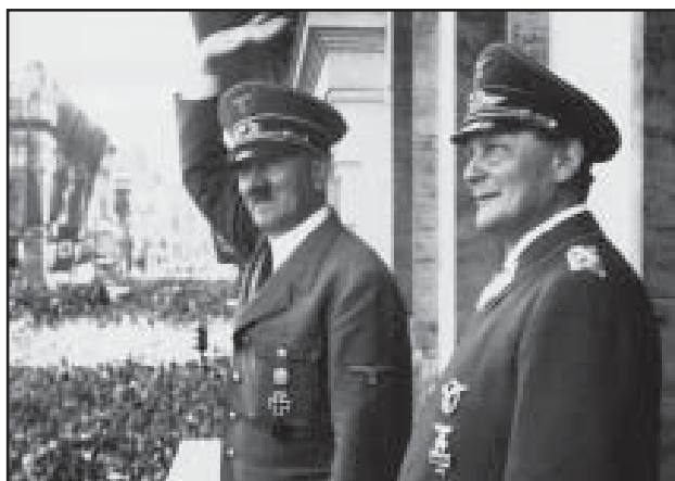
Adolf Hitler and Hermann Goering in more glorious times. By the summer of 1945, Hitler was dead, and Goering, once-successor to the Führer, was a common prisoner and would soon be tried for crimes against humanity