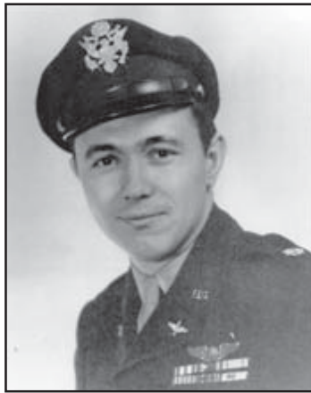
The author, Theodore “Dutch” Van Kirk

It was just like any other mission: some people are reading books, some are taking naps. When the bomb left the airplane, the plane jumped because you released 10,000 pounds. Immediately Paul took the airplane to a 180-degree turn. We lost 2,000 feet on the turn and ran away as fast as we could. Then it exploded. All we saw in the airplane was a bright flash. Shortly after that, the first shock wave hit us, and the plane snapped all over. We looked to