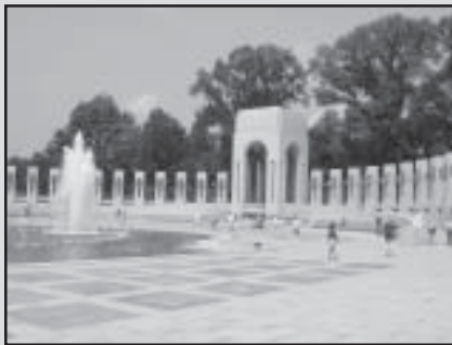
The National World War II Memorial