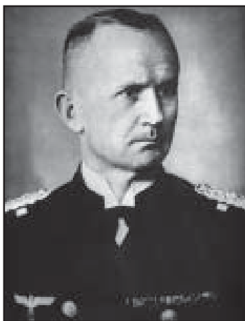
Grand Admiral Karl Doenitz, the last Führer of the Reich. Prior to his suicide, Hitler appointed Doenitz as his successor, in what was a final insult to his former second in command, Hermann Goering

As the number of our “guests” increased, I became more and more intrigued. It seemed that every Nazi ever mentioned in the news during the late thirties and early forties was here under one roof in little Luxembourg. Alfred Rosenberg, the Nazi philosopher, Walter Funk, the president of the Reichsbank; a bevy of