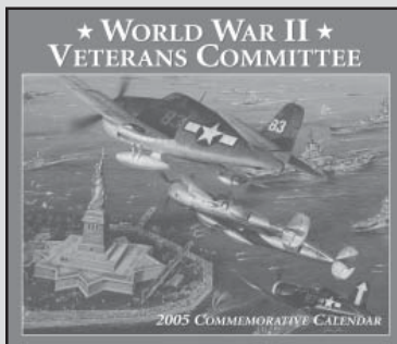
A sample cover from the 2005 commemorative calendar

Available just in time for fall is the World War II Veterans Committee 2006 Commemorative Calendar. This glossy oversized calendar features colorized reproductions of some of the most famous and legendary moments of World War II, including the flag-raising at Iwo Jima, General Eisenhower addressing the troops prior to D-Day, and General MacArthur returning to the Philippines.