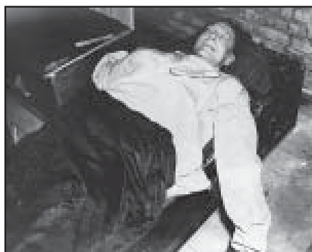
Hermann Goering, former Reichsmarschall, commander of the Luftwaffe, and hero of the legendary Richthofen Squadron, lies dead in his cell following the Nuremberg trials. He had famously cheated the hangman's noose by having a cyanide pill smuggled to him just hours before his scheduled execution

At about the same time, an order from General Eisenhower was issued to all PW installations clarifying the status of the high-ranking Nazis. They were to be treated as declassified prisoners of war, all of equal rank. They were to be addressed only as "Mister," with no military rank or official title or exchange of salutes. Those still wearing uniforms were required to remove all insignia of rank and all decorations. Their daily rations were those prescribed by the Geneva Convention for all prisoners of war, sixteen hundred calories per day.