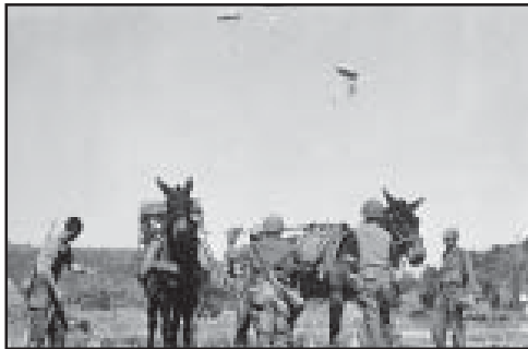
Artillerymen of the MTF receive parachuted supplies of ammunition, packing it onto mules. The Mars Task Force was virtually indistinguishable from Merrill's Marauders, except the MTF contained artillery

My second artillery incident happened near the end of January. “L” Company had been ambushed while on a combat patrol. The company commander, a platoon leader, radio operator and six others were killed. Several friends of mine from Fort Riley were in that platoon, and the next day I walked around the perimeter to check on them. They were alright, though still in shock. On my way back, I was about 50 yards from my own foxhole when I heard one of the big guns fire, and the express train rumble told me, and everyone else, that a 155mm shell was coming our way.