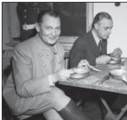
Far from the lifestyle he was accustomed to, a smiling Hermann Goering eats lunch next to Alfred Rosenberg during the later Nuremberg trials

Goering explained, “No, he was born a bastard . His biological father was a Jew, but his legal father was a Christian.” In this case, as in others, the law could be stretched if it was convenient to do so. “In Germany, a Jew is whoever I say is a Jew,” said Goering.