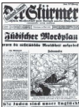
The front page of a 1934 issue of Der Stürmer , Streicher’s virulently anti-Semitic newspaper. The picture depicts the blood of Germany pouring onto the platters of the Jews

These were the Nazi “Bonzen”—the persons largely responsible for the inhuman atrocities associated with the Nazi leadership. The General Staff group avoided them, with disdain. In turn, they blamed the generals for losing their glorious war and the Thousand Year Reich. No love was lost between those two groups.