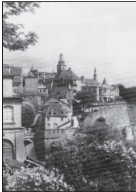
The city of Luxembourg as it appeared in 1945. The tower of St. Michael’s Church rises above the city