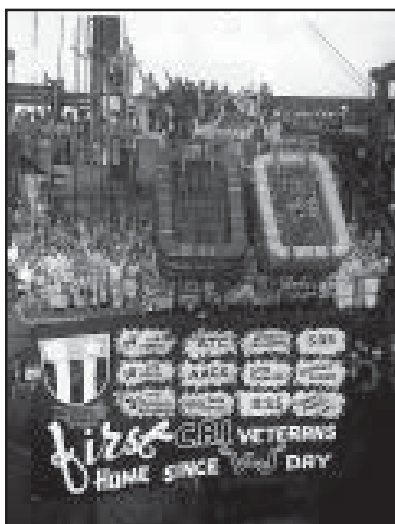
Cheering veterans of the CBI return home aboard the USAT General A.W. Greely . Among them were men from Merrill's Marauders, Flying Tigers, and Mars Task Force