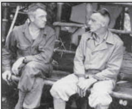
Brig. Gen. Frank Merrill and Lt. Gen. Joseph Stilwell: the leaders on the ground