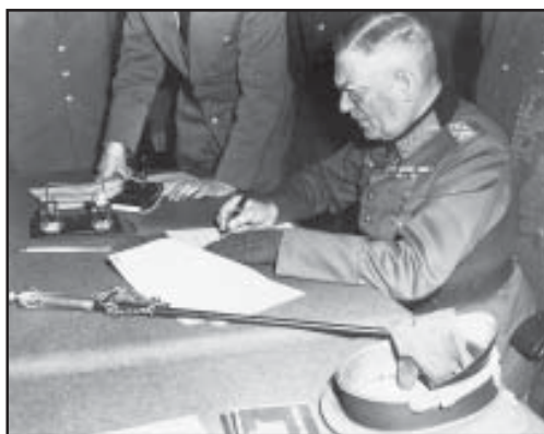
Generalfieldmarschall Wilhelm Keitel surrenders to the hated Russians. He would join much of the German military elite at “Ashcan”