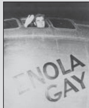
Then-Colonel Paul Tibbets prepares for the takeoff of the Enola Gay