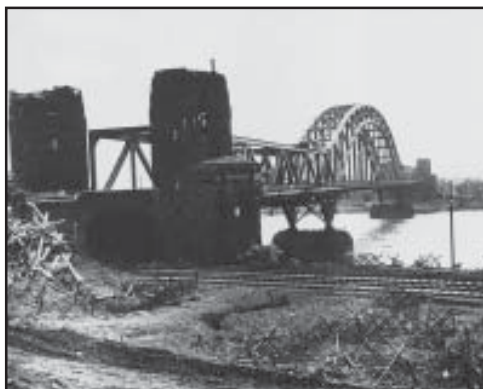
The Ludendorff Bridge at Remagen. Captured by the Allies, it was the only bridge not destroyed before the Allies advanced over the Rhine and further into Germany