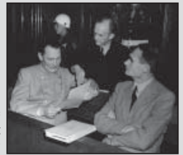
Hermann Goering, Karl Doenitz, and Rudolf Hess confer during the Nuremberg Trials

Sixty years ago, this fall, all eyes were fixed on the German city of Nuremberg, where the surviving leaders of the Third Reich were awaiting trial for some of the greatest crimes against humanity in the history of mankind. However, though they were now receiving their due justice, only months before the world was wondering whatever happened to the Nazi leadership. Some speculated that they had fled to South America; others believed that they were regrouping in the Alps, poised to make a return. In fact, they had been rounded up by the Allies, and were being held in a little town in the Grand Duchy of Luxembourg. In this issue, the last surviving man who was charged with interrogating these Nazis prior to the Nuremberg trials tells his story.