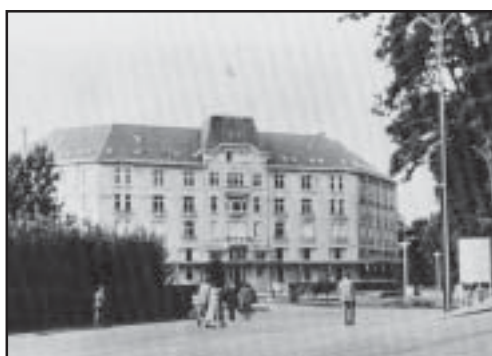
The Palace Hotel in Mondorf, Luxembourg. A heavily guarded prisoner of war enclosure, it contained some of the most infamous characters of the Third Reich

Our jeep came around the bend and halted at an enormous gate, part of a fifteen-foot high barbed wire fence that stretched around the main building, a driveway, and gardens. On each corner of the fence stood a guard tower. Two soldiers and a very visible machine gun ominously occupied each tower. Camouflage nets and large planes of canvas hung on trees and posts all around the place. It was to prevent anyone from seeing what went on inside that fence. There were huge klieg lights overhead. I discovered later that two strands of wire on that fence were electrified. None of the PW enclosures in which I had worked were protected as heavily as this one.