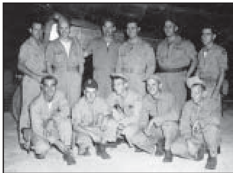
The crew of the Enola Gay prior to takeoff for Hiroshima

This year, 2005, marks the sixtieth year since the end of World War II. The summer of 1945 was indeed an anxious one as Allied and American forces gathered for the inevitable invasion of the Japanese homeland. President Truman made one last demand, one final appeal. Together with Great Britain's Churchill, and Russia's Stalin, the President of the United States urged the Japanese to "... proclaim the unconditional surrender of all Japanese armed forces...The alternative," they said, "for Japan is prompt and utter destruction." Ignoring the obvious military situation, the Japanese Prime Minister Baron Kantaro Suzuki issued the Japanese refusal to surrender which included these words: "... there is no other recourse but to ignore it (the surrender demand) entirely and resolutely fight for the successful conclusion of the war."