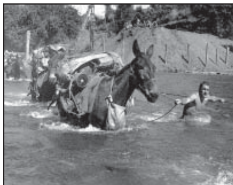
Thousands of mules served the men of the Mars Task Force

The Marauders were primarily infantry. The Marsmen were a much more mixed bag. The 475 th contained about 3,000 men while the 124 th had about 2,000. These troops were to provide the main combat strength. However, in support we also had major elements that were lacking for the Marauders and the Chindits (the British Long Range Penetration Group that was the model for the Marauders), and proved to be a major handicap in their operations. Added to our basic infantry strength were the 612 th and 613 th Field Artillery Battalions (Pack), three portable surgical hospitals, and a half-dozen quartermaster and veterinary pack troops, bringing the total to well over 6,000 men.