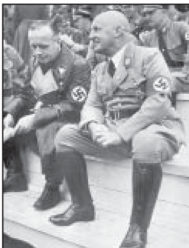
The notorious Julius Streicher (right)—the “Jew-baiter”—with Joachim von Ribbentrop at a Nazi ceremony

of the Nazi regime. Later they were joined on our roster by Field Marshals Gerd von Rundstedt and Werner von Blomberg; Generals Heinz Guderian and Sepp Dietrich; and a few more admirals. The German General Staff group hung together. They wanted as little as possible to do with the other prisoners. And they were quite willing to denounce their fellow inmates in the course of interrogations and discussions.